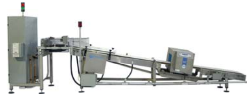
Jones Legend® Series L200 Cartoner