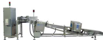
Jones Legend® Series L200 Cartoner System