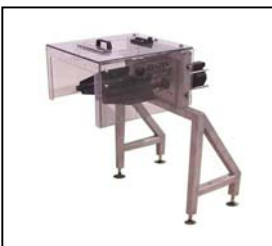
Servo Paddle System

Servo-Paddle Transfer and Infeed System (No Mechanical Wear Parts, Electronics, Variable to High Speed, No Maintenance )